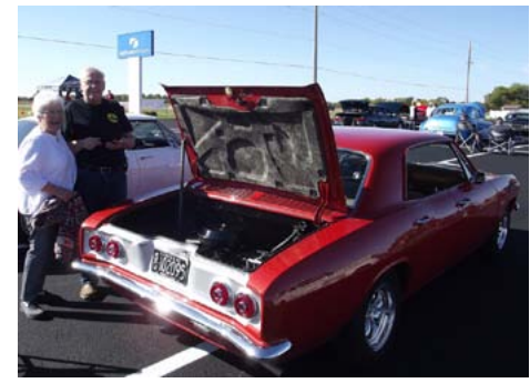
FOR SALE 1964 Corvair Monza convertible Solid, clean driver. 110 hp engine with automatic PowerGlide transmission. Rebuilt engine and front end. Originally a Spyder. Has exhaust cutout and