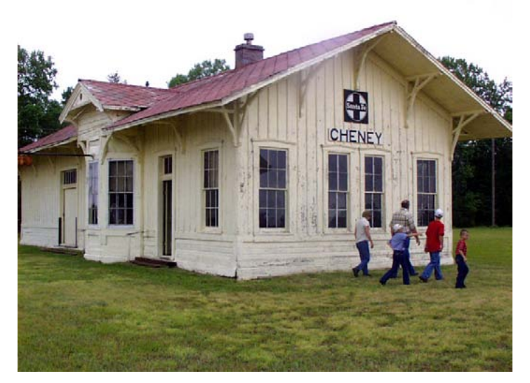
The Souders Historical Farm Museum tour is part of the trip. Cheney depot is one of several buildings.