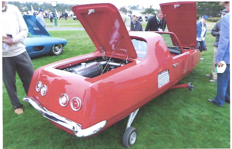
1967 Gyro-X Alex Tremulis Prototype

Alex Tremulis is perhaps best known for his work to make the Tucker 48's design production-ready, but this Gyro-X is at least as interesting a design. Gyro Transport Systems in California asked Tremulis to design this prototype using a hydraulically driven gyroscope to keep the car upright. Drive power came from a 1.3-liter Mini engine and while the concept worked, it never went into production. The training wheels on either side keep the primarily two-wheeled vehicle from falling over while the gyroscope is warming up.