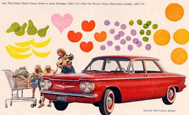
Corvair 700 4-Door Sedan

See The Dinah Shore Chevy Show in color Sundays, NBC-TV—The Pat Boone Chevy Showroom weekly, ABC-TV.