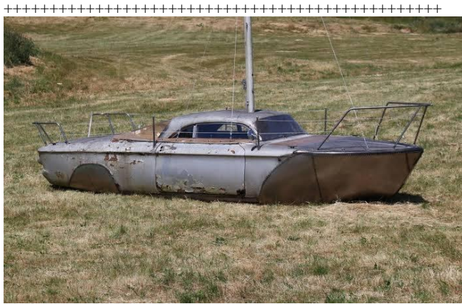
Rumor has it Pat Murphy has been looking at another Corvair boat.

July 28 - SANBORN-LEWISTON FARM FESTIVAL, TRACTOR SHOW & CLASSIC CAR CRUISE - Sanborn-Lewiston Farm Museum, 2660 Saunders Settlement Rd (Rt. 31, one mile E of Rt 429) Sanborn, NY. 8am-4pm. Car cruise, tractor display, parade, flea market, crafts, basket auction. Sponsored by Sanborn Area Historical Society. INFO: Bonnie 716-990-6909