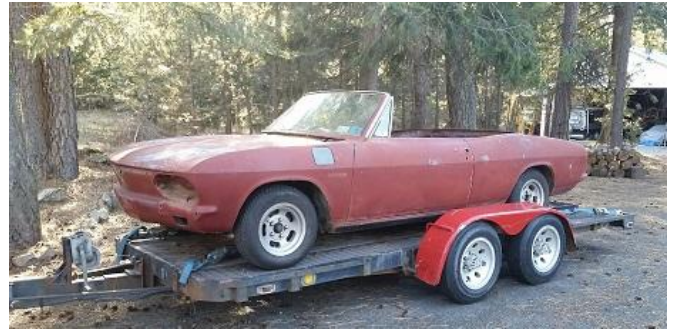
Tom Koprevich has started on yet another Corvair project, this time a late model convertible. There is a build thread on Corvair Center.

http://corvaircenter.com/phorum/read.php?1,965605,page=1