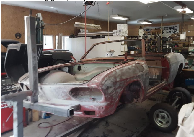
Tom, you've been busy, thanks for posting these pictures