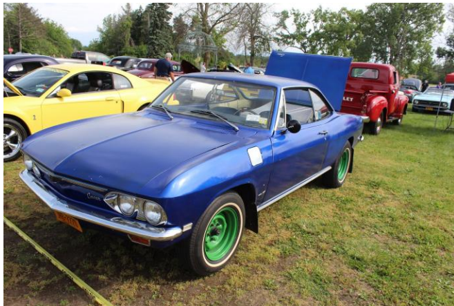
Spotted at the Wurlitzer cruise night, Toronado power in the back