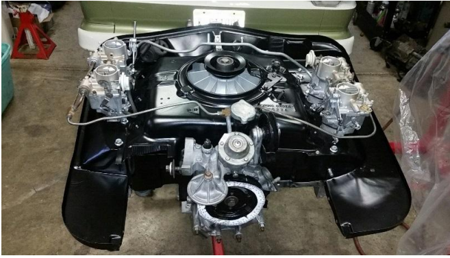
Motor looking good, body on a rotator