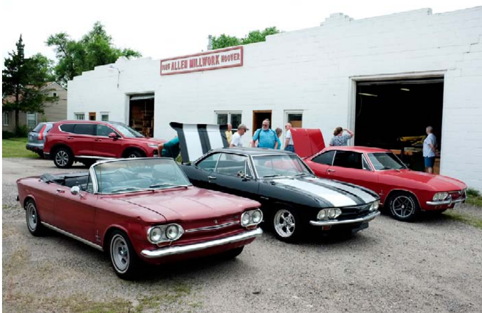
The final stop of the road trip was Allen Millworks in Northwest Wichita. Once again the Corvairs got front row parking.