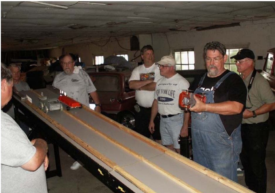
One major project of the 2009 Juna Tuna was to learn how to assemble the original MCCA valve cover track. That took awhile, then it was time to make some trial runs with the home built valve cover racers.