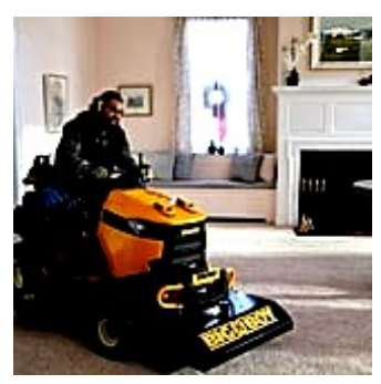
VACUUM with 240 hp pure chore torque