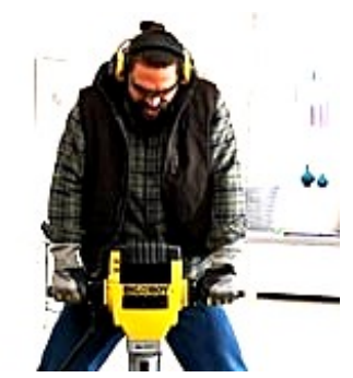
CARPET CLEANER that annihilates carpet stains