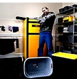
WASHER six feet tall