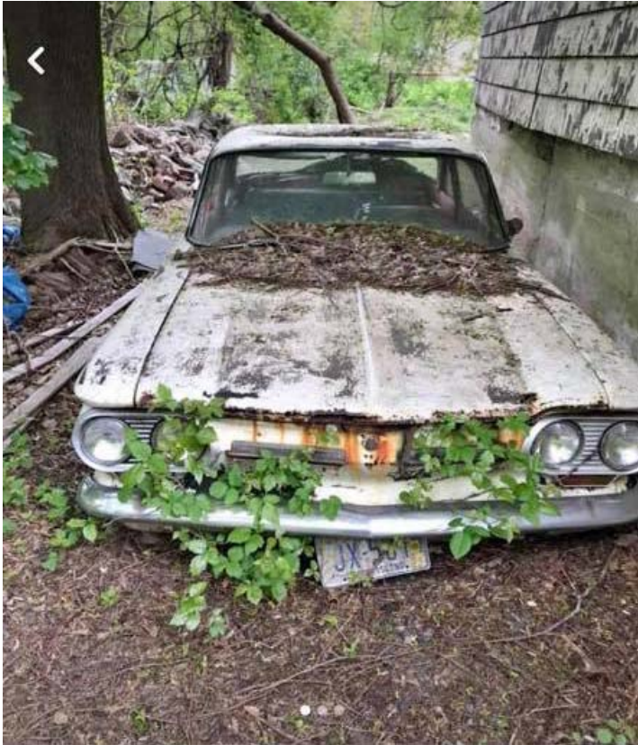
This "Ran When Parked" photo is from a for sale listing on Facebook Marketplace. Information with the photo was, "1967 Other Corvair, $100 Automatic transmission, Lincoln, RI. Send your RWP photos to Terry."