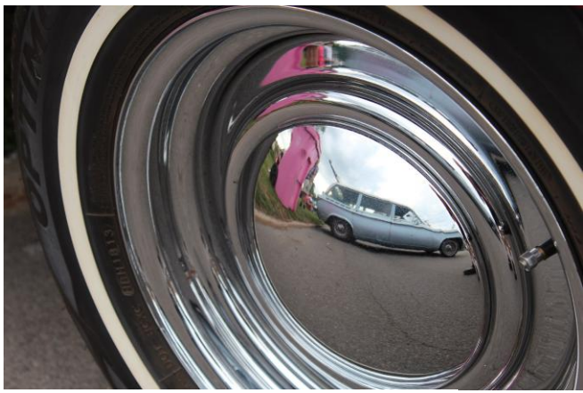
What is that reflected in that baby moon hubcap?

It's been a crazy year, everywhere I went with a Corvair has gotten great response from people. If anyone has any pictures, stories, or info for the newsletter please send them in.