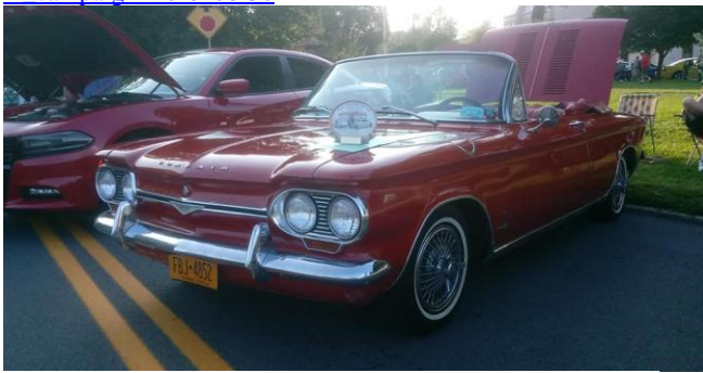
Ben Wild had 2 cars out on Labor day and took home an award with the convertible!