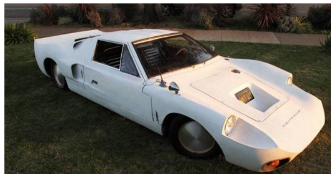
At $6,500, Could This 1968 Bill Harrah Custom Corvair Be The Centaur Of Your World? https://jalopnik.com/at-6-500-could-this-1968-bill-harrah-custom-corvair-b-

1837795733?fbclid=IwAR3sjwScvSHZIwKeUOkfGOGq_xFeqVyc3pO CcwYnYZCku1Yv7Ip0fsKl0qU