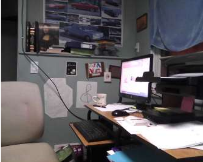
The real thing, again!

As I write this, one week remains before Palouse Days. I hope many of you have decided to head south and participate in the festivities. The Show and Shine car show is a great event and at a most reasonable price. There is also a parade and I hope more of you have decided to take part in that as well.