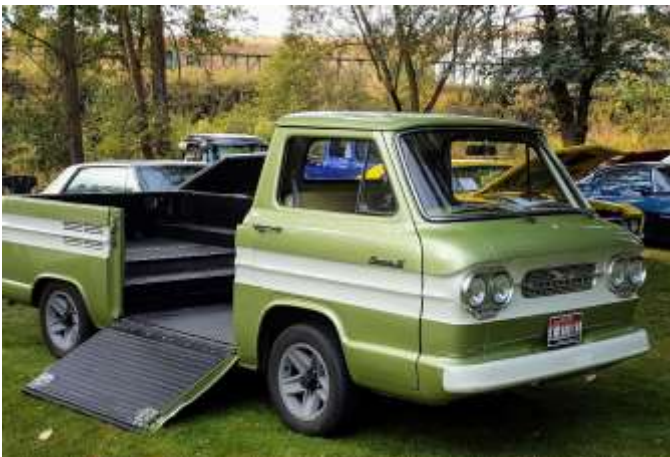
Craig's Rampside at Palouse Days Show and Shine in September of 2018.