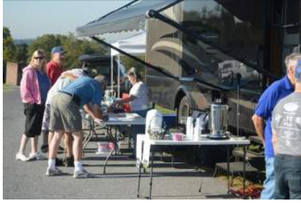
Guest registering at Registration Table.