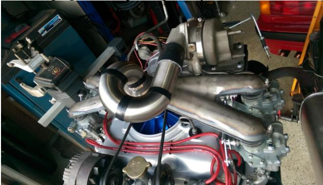
Tom made a custom fixed orifice pipe.