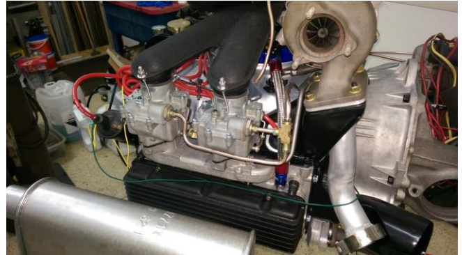
Can't wait to see and hear it.

Attention NFCC members! There may be some door prizes at the October 16 th meeting. And for those interested, dinner at the Anchor bar on