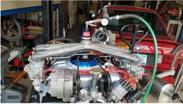
No leaks at 30 PSI