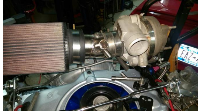
Welded ports for boost return valve, crankcase vapor return and methanol injection to air filter mount.

Read the complete build on Corvair Center http://corvaircenter.com/phorum/read.php?1,1010817,page=9