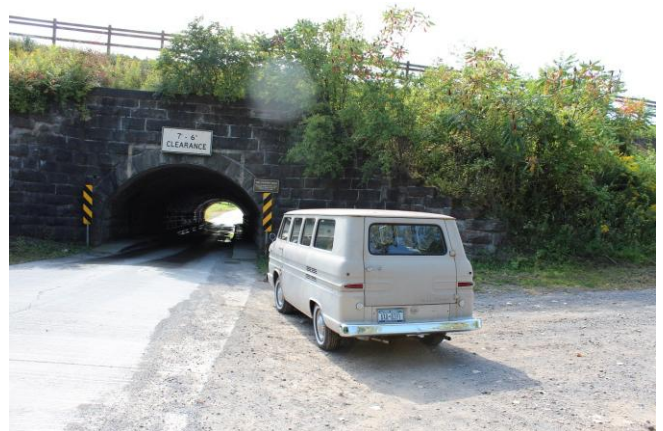
Will it fit? Looks really small on the other end.