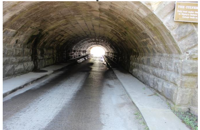
And it's dripping, a lot