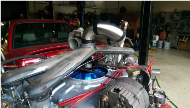
Mocking up intake getting ready to weld