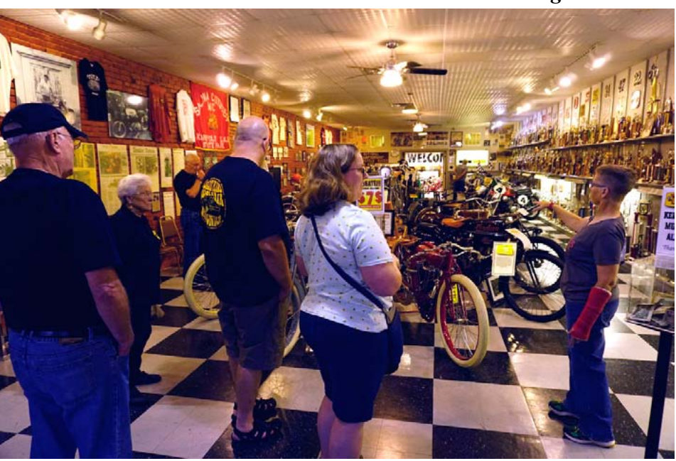
The MCCA tour group gets an introduction to the museum from the docent. There are three large rooms of motorcycles and more.