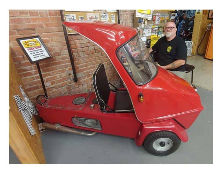
Bill Smith checks out a rack of motorcycle literature and this very unusual three wheeled scooter with an impressive fairing.