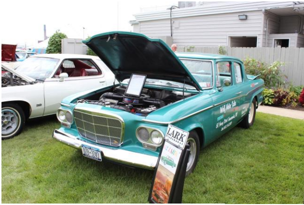
Pat Pilon brought the Studebaker