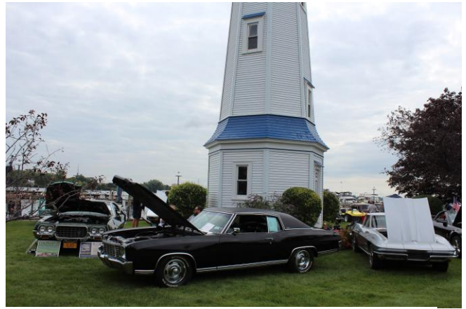
The Buffalo Launch Club on Grand Island is just a beautiful setting for a car show.