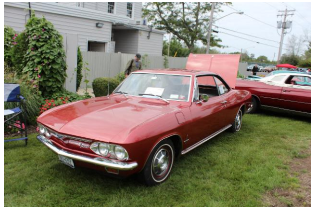
I brought the 67 Monza to the Car and Boat show on Grand Island

Also have 3 driver's side window for a late model 2 door, and one window regulator. Free come and get them, one piece or all. 716-439-5194 or email me gswiatowy@rochester.rr.com