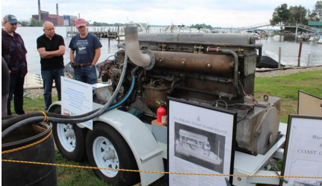
Buffalo built Sterling boat engine was a hit. They started it up several times during the show. It is a project to start!