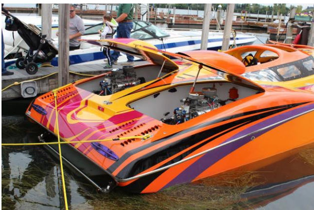
This one sounded sweet when fired up