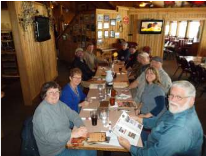
INCC planning meeting a few years ago.

Date, Time, and Place to be Determined (We should schedule an event each month of the year. If we do not have anything for a month, we should have a set time and place to get together as a club.)