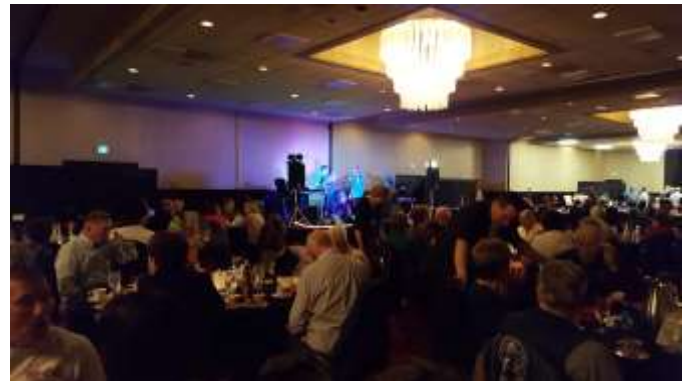
The crowd at last year's Show No Shine Banquet

If enough INCC members decide to go, perhaps the club could cover a portion of the cost? This is just an idea/thought.)