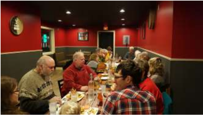
Some of the crowd at last year's Christmas Party!

Sunday, December 15 th , 5:00 pm at Valley Longhorn Barbeque, 2315 N. Argonne, Rd.