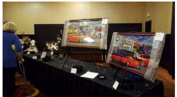
Some of the door-prizes/raffle items available at last year's Show No Shine Banquet