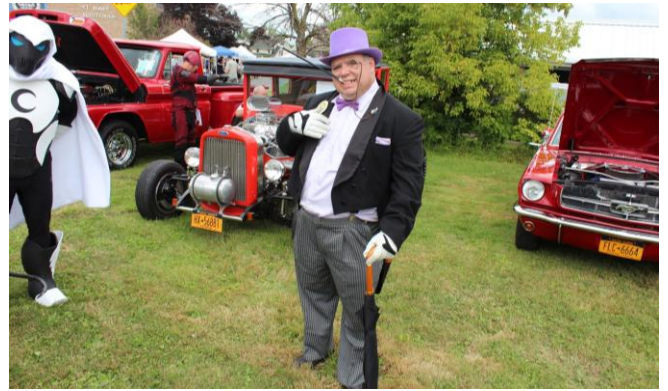
Holy Car Shows! The Penguin was there!