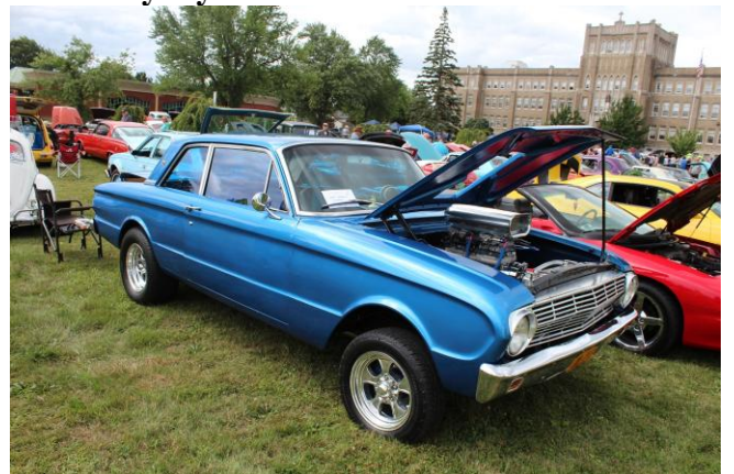
Cool Falcon Gasser