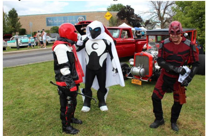
Other costumed characters as well.