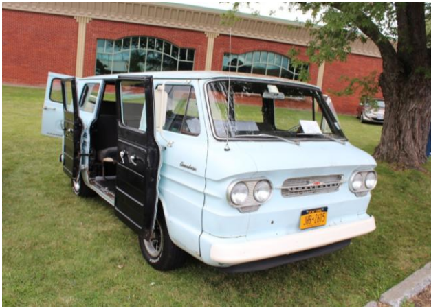
Mount St. Mary's Academy show