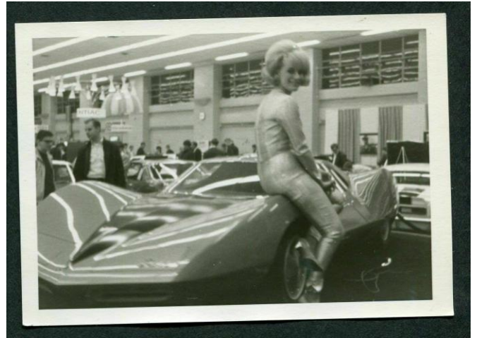
Corvair Astro 1 with model.

AUTO ANTIQUES • COLLECTIBLES • TOYS • MODELS • CLASSIC • ROD • TRUCK • TOOLS