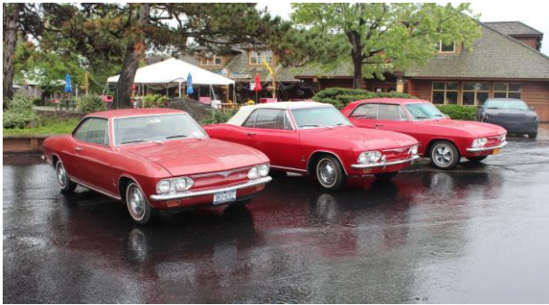
Another picture of wet Corvairs at Darien Lake.

I have not one but 2 late model Corvair rear windows, the backlight or rear windshield for a 2-door. Came from the Bob Covel parts stash. Also have 3 driver's side window for a late model 2 door. Free come and get them, one piece or all. 716-439-5194 or email me gswiatowy@rochester.rr.com