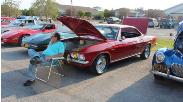
You never know who will show up at a Cruise Night. Here's someone we haven't seen in awhile.