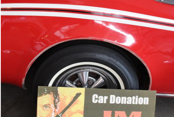
Wheel wells appear to have been trimmed, likely for the rough landing.