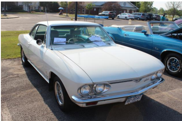
Here is my dry 66 Monza from the Elderwood Wheatfield Cruise.