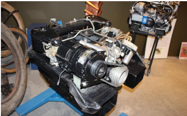
The Canadair and Spyder motors are still on display at the museum.