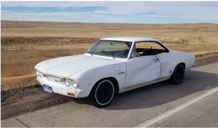
Photo Op in western Kansas. Body damage jammed the driver's side door and damaged several windows. Sean had to crawl thru the window to get in.