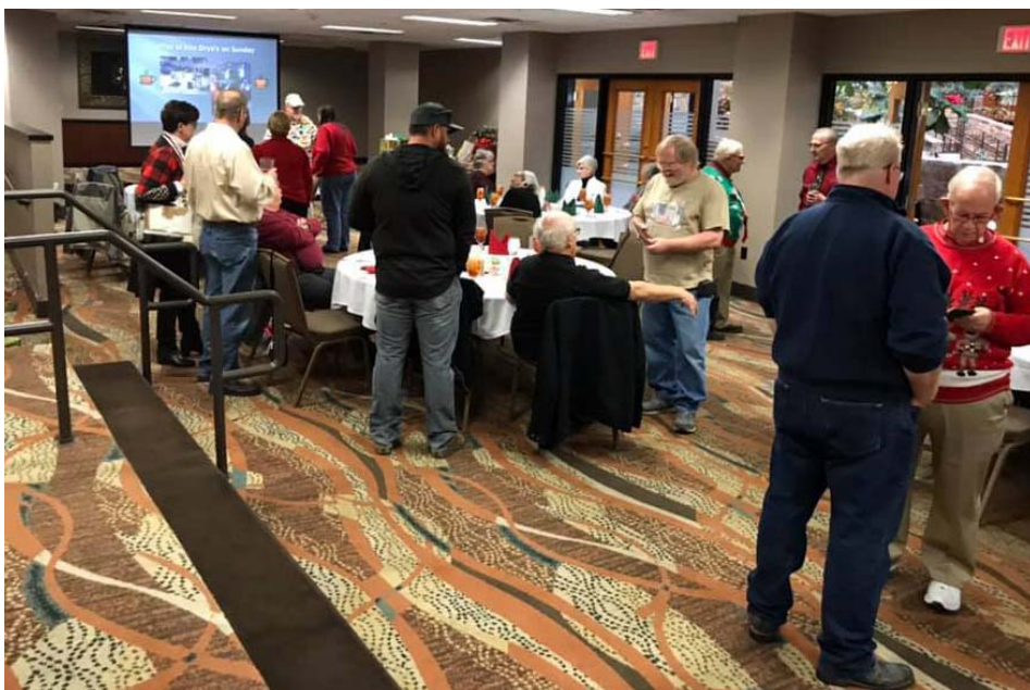
Members and friends of COCA socialize at the Embassy Suites Will Rogers Airport before the Christmas repast.