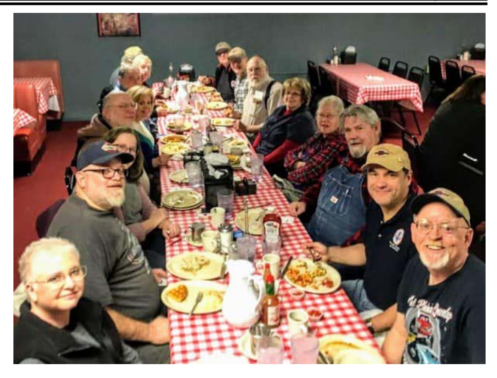
A happy group at Fat Ernies as most of them had either finished or were in the process of finishing a fine January MCCA breakfast.

Ernie's menu was basic traditional comfort food breakfast fare. After everyone had ordered and been served there were waffles, eggs (fixed many different ways) bacon, toast, hash browns, omelettes and one huge Chicken Fried