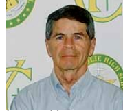
Submitted by Joe Darinsig