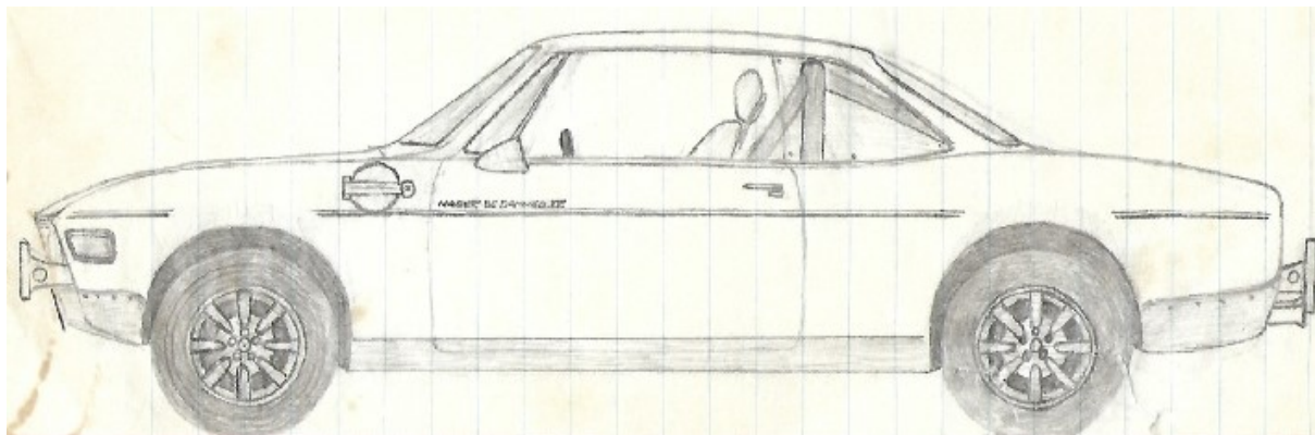
Drawing done by Bruce Culp a few years ago.