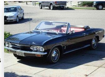
A 1965 convertible in almost new condition with 47K, bought for $3700