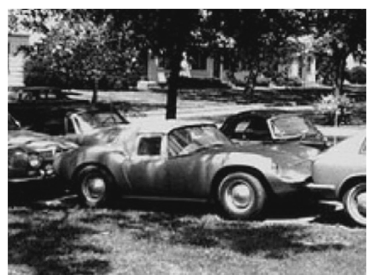
The first Devin photo Terry Boyce sent was of Gerald Black's driveway crowded with interesting cars.