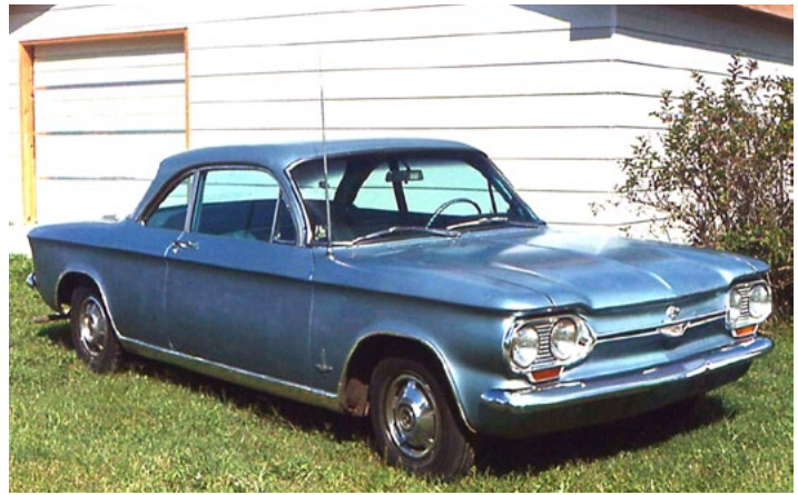
The '64 Corvair I purchased from Gerald Black setting outside the storage garage in Udall.