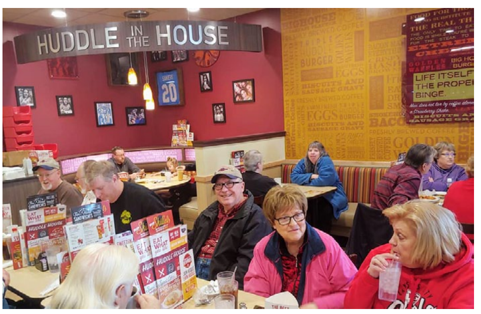
The crew at the Huddle House pushed a line of tables together thru the middle of the cafe for MCCA members.