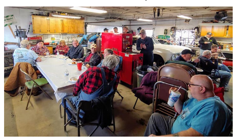
Once the eating began the noise level in the Kalp shop dropped quickly. With a good crowd and two Corvairs space was tight in the shop.