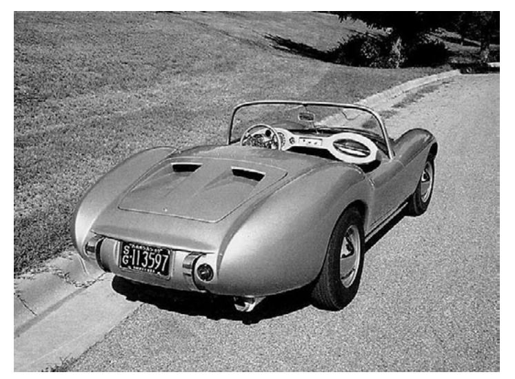
This black & white photo of the Devin was taken in Riverside Park. The Kansas tag reads 1966.