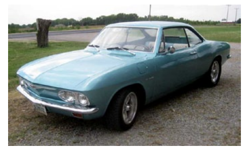
FOR SALE 1965 Corvair 500 3-speed 110hp vintage green and

FOR SALE 1965 Corvair Monza 4-speed 95hp Corbeau front seats, rear seat redone to match, front disc brakes, Bluetooth radio. Volt, oil pressure and temperature gauges. Finned aluminum oil pan. Everything works. Body has some lumps and bumps. Drive anywhere. $3750 Call or Text Terry 316-882-3056 or email tkalp@cox.net