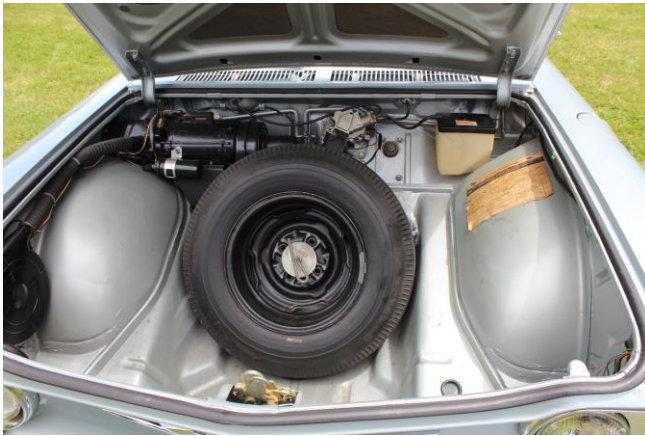
More pictures of Chuck Facklam's 1960