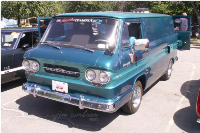
Look was featured on BuffaloCars.com Real rides of WNY on March 4, 2020 picture was from the 2015 Buffalo History Museum Show. https://buffalocars.com/realrides-2037-030420