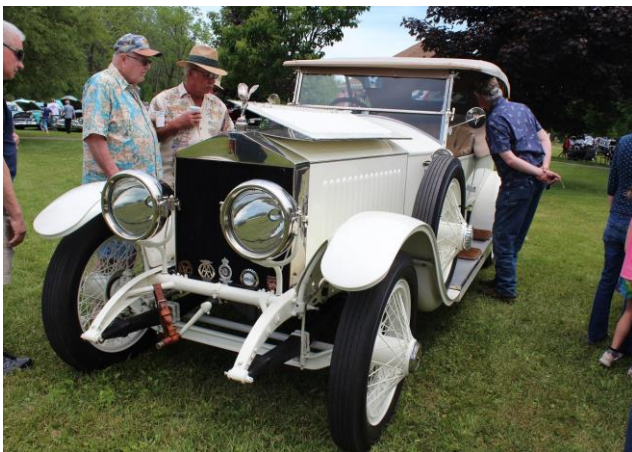
This vintage Rolls drew a crowd all day. So did the Cadillac below.

And a Happy Birthday to Ralph Nader. February 27 th , 1934. Ralph is to thank for keeping the Corvair in production for another 3 years instead of ending its run at the end of 1966 production. Pictured above with the Corvair in the Museum of Tort Law he has in Winstead, Connecticut.