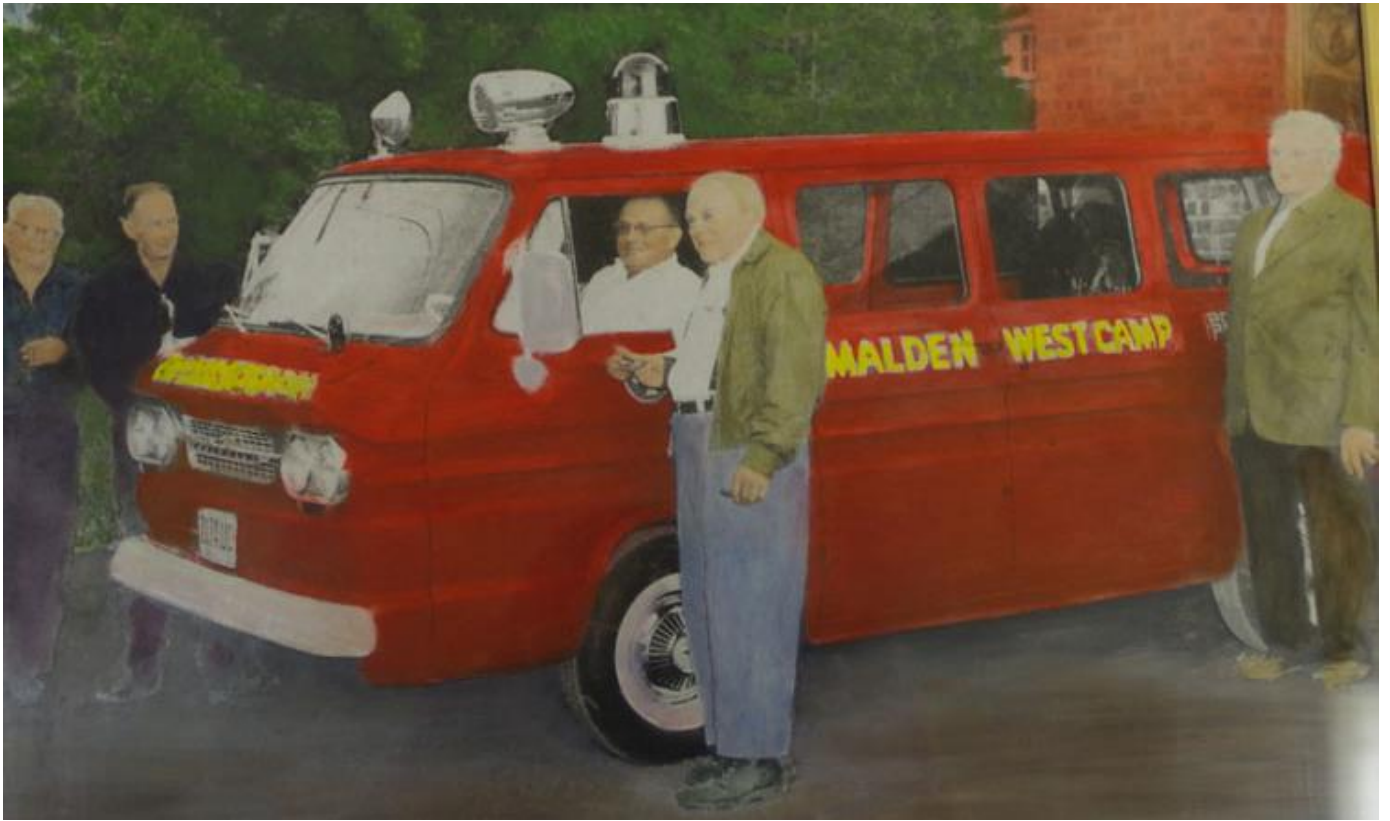
This is a painting of the van when it was presented to the fire department,