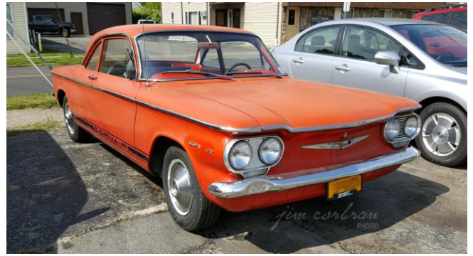
This Real Rides of WMY 60 Corvair was spotted in N Tonawanda and featured on September 20, 2019

https://buffalocars.com/realrides-1872-092019