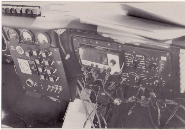
In a cockpit whose complexity recalled that of the "Holden" prototype shown earlier, MIT's electric Corvair had batteries of switches, knobs and indicators. They assisted in monitoring and controlling the car's systems.