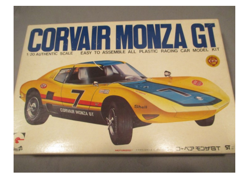
Picture of a RARE Corvair Monza GT model kit. Only available in Japan.