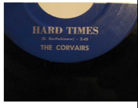
Picture of 45 rpm record, by the CORVAIRS group. I have about 20 45 rpm records of songs by them.