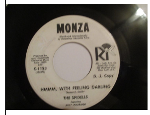
Picture of 45 rpm record with the MONZA label. I have about 12 different records using the Monza label.