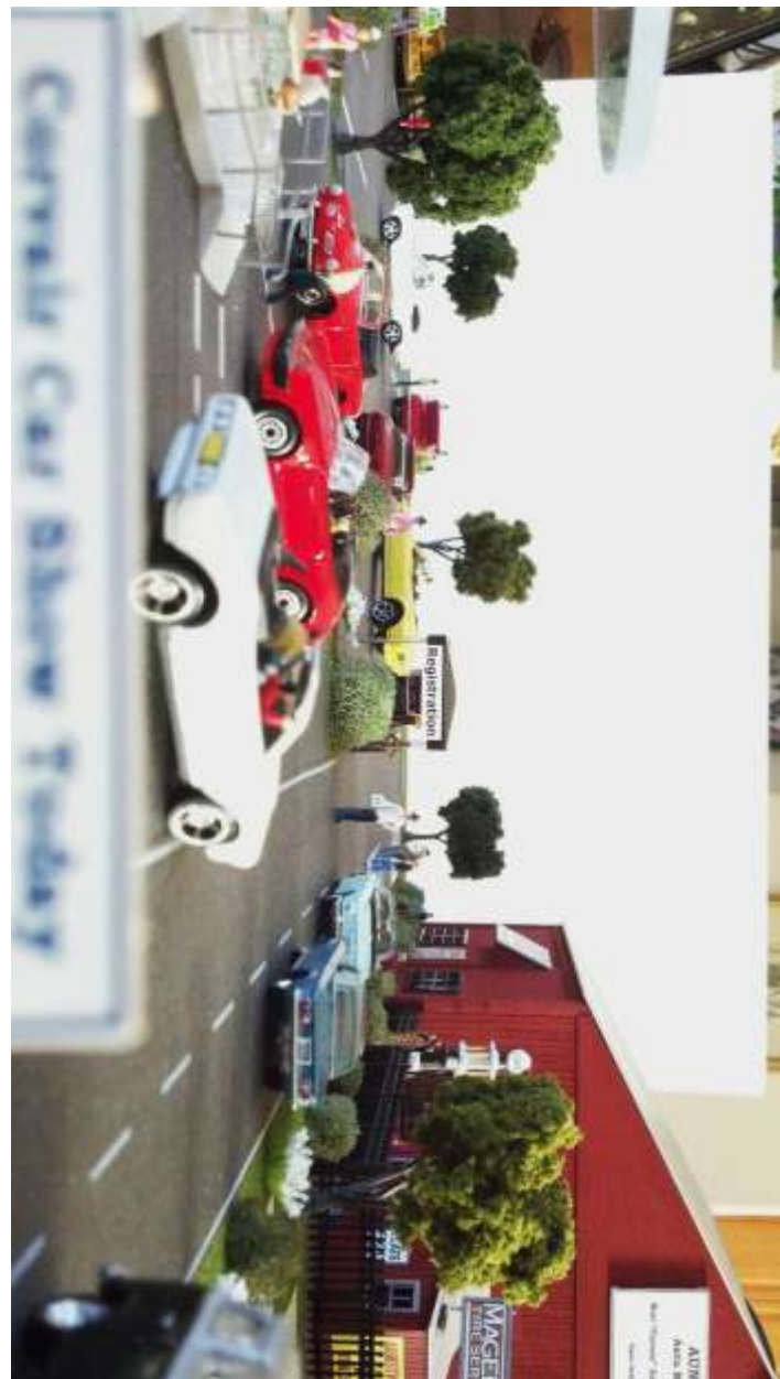
A portion of Roger's diorama set up. Sorry to put it sideways, but that allows you to see it fairly clearly. If not, it would be so small you couldn't see much.