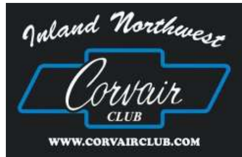
The front of the card looks like this.