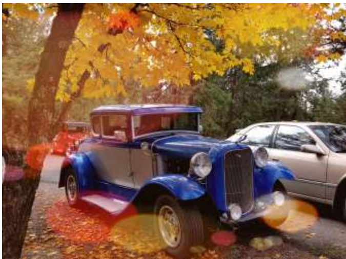
No Corvairs, but this was taken a Tech-n-Tune at Craig's in the fall 2016. I again used some of the special effects available on my phone to come up with this particular image.