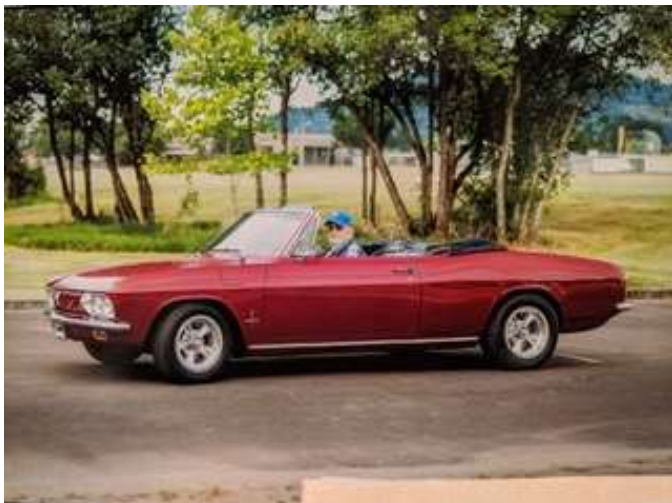
This Corvair is for sale. Details can be found in the newsletter