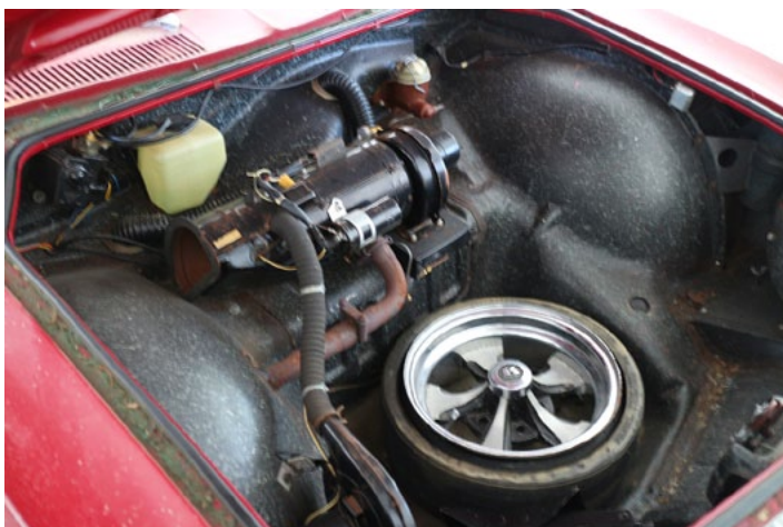
More Glenn touches in the trunk. A gas heater from a '60-'64 Corvair was adapted to the '65 convertible for instant heat. Space Saver Spare fits like a glove.