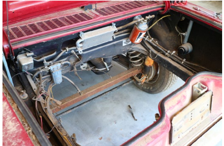
Glenn Ziesenis touches in the engine compartment. Remote oil filter and cooler, power antenna, and bracket for moving the car without transaxle.