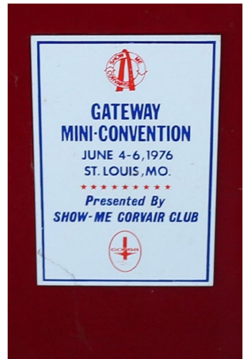
This sticker on the engine lid is from one of the last shows the red convertible attended. Shortly afterward the drivetrain was removed and the body was stored.