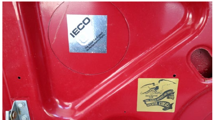
A couple more vintage '70s stickers grace the inside of the engine cover. IECO was a major supplier of VW and Corvair performance parts.