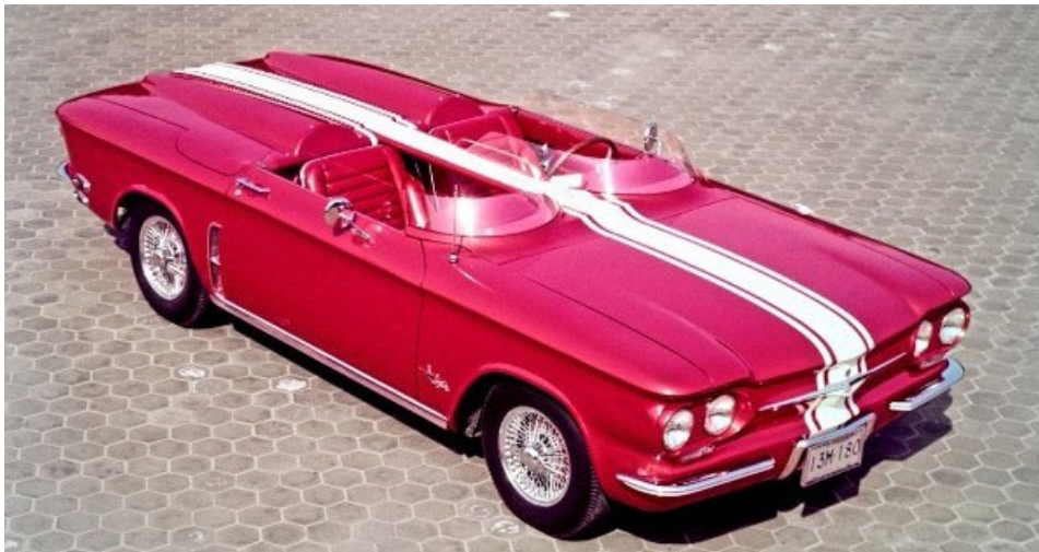
GM styling boss Bill Mitchell was a for-real sports car enthusiast. And he could see that the Corvair provided all the components to create a real two-place sports car. Eliminate the back seat, add sports car styling, and you have the Corvair Sebring Spyder, a sporting two-seater.