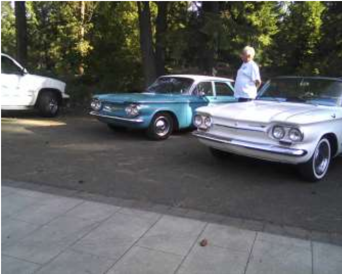
Taken at a spring time Tech-N-Tune, way back in 2013.

Our Treasurer's Report is sent monthly to Inland Northwest Club members only, via e-mail or USPS.