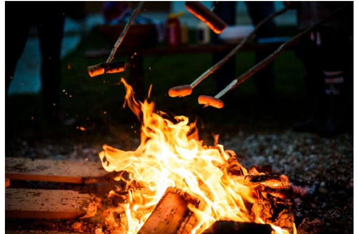
Hot dogs & marshmallows are on the menu for the Pre-meeting eating. The fire and food are free.