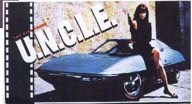
Below is the hardest one to find