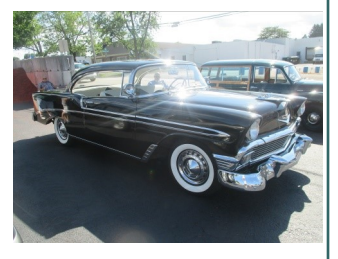
July 11, 2020: Chariots of Fire Car Club Show at the Morgantown Auto Mall. Over 200+ vehicles at this show. The Auto Mall has over 400 vehicles inside and about 100 outside for sale. If you have never been this is a "must" to see this place.