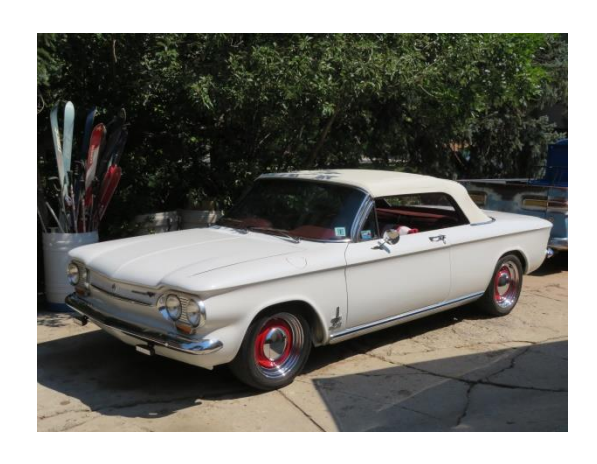
Rick Beets's 64 Spyder