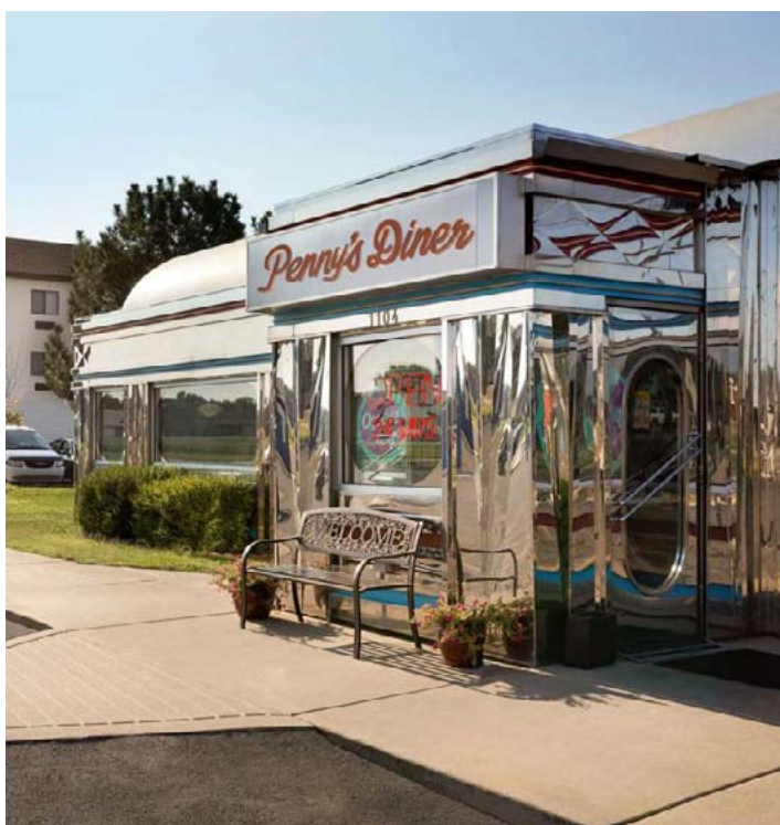
Penny's Diner is a national chain, but has a nostalgic theme based on '50's American diner.

Then on to Penny's Diner in Wellington for lunch. Penny's is located at 1104 E 16th Street. Penny's is styled after the diners of the 40's and 50's. After lunch we will disperse back to Wichita.