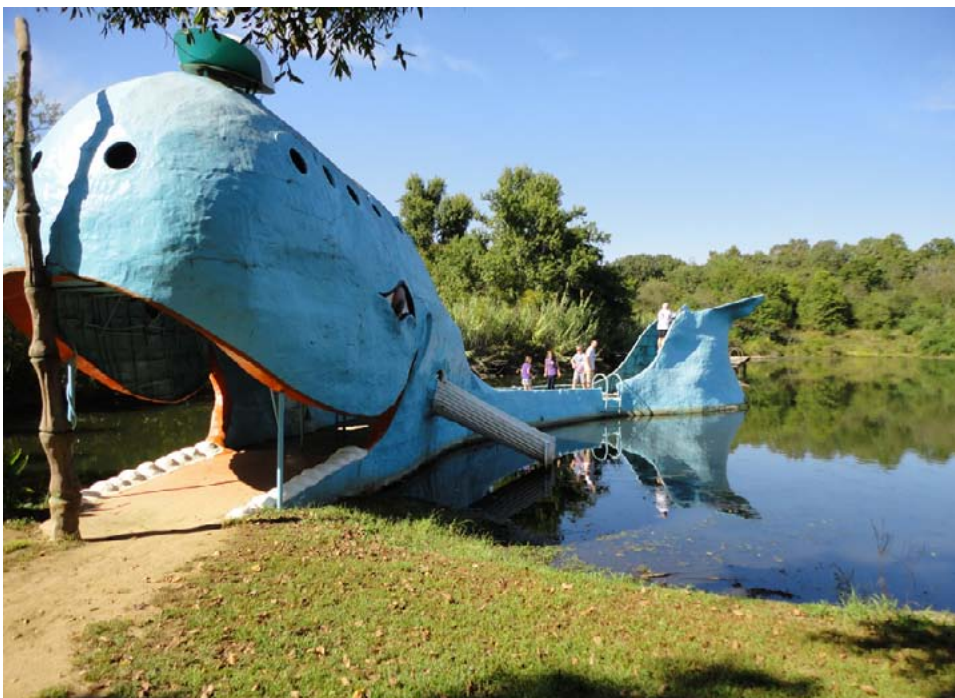
The 2010 Great Plains Corvair Roundup was hosted by the Tulsa Club. There was a Saturday lunch tour that included portions of Rt 66. One of the tour stops was the Blue Whale, a Rt 66 icon.