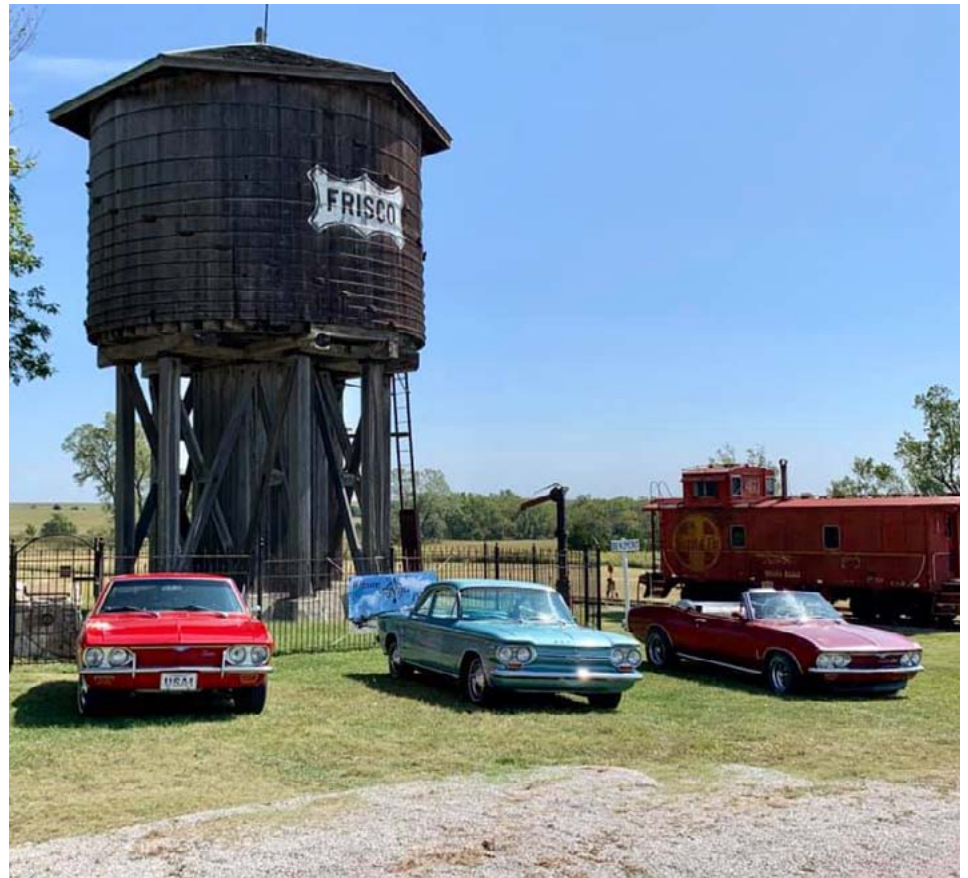
The historic 1885 water tower in Beaumont makes a great backdrop for the Corvairs on the September Road Trip. See story on pages 4&5.

The November meeting will return to the Bright's for an Italian Dinner. More details to come.