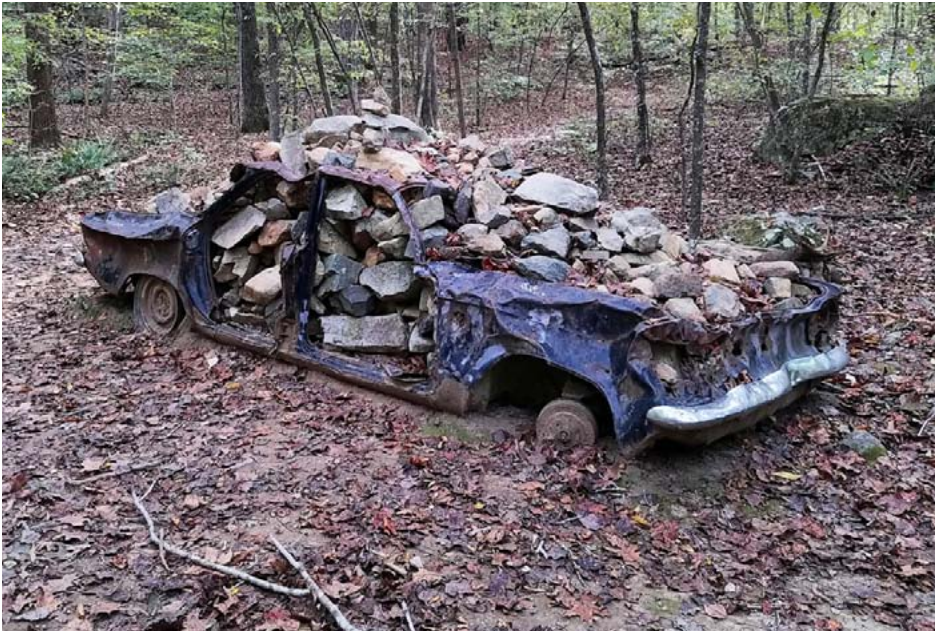
Ran When Parked. Don't drive stoned. Not sure what the story is behind this poor Corvair located in Chapel Hill, NC, but bet it would be an interesting one. Send Ran When Parked photos to tkalp@cox.net