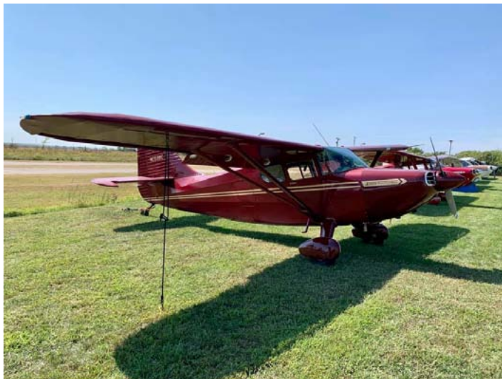
The Stinson Aircraft Club held a fly-in the same time as the Corvair road trip. The company was started in Dayton, OH then moved to Detroit Eventually the company was bought out by Piper Aircraft.

The MCCA group then made our way back the way we came and ended up at a vintage flea market. At the flea market many vendors set up selling antiques. Had a good time and seen many relics, but in the end, none of us found anything that we could have lived without. The weather was windy but very comfortable starting out, and as the day progressed, the weather warmed up quite a bit. Made for an excellent day to enjoy fellowship with other members and create memories. Thank you all who attended.