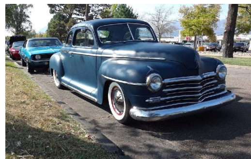
Above: Dave's Car looking good and representing our favorite rear engine wonder. Also picture are some other cars present at the cruise, and a thank you display to participants.