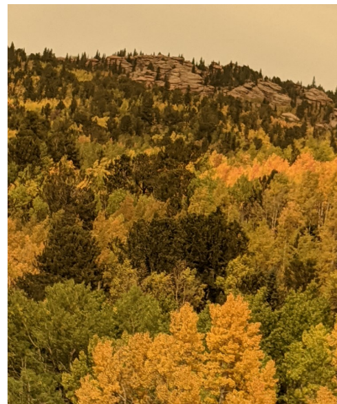
One of the many color filled hillsides on the drive.