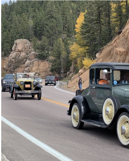
Model A's on the way to Victor

leaves this year definitely did not disappoint! It seemed every Aspen was showing off the glorious colors of "Aspen Gold" from palest yellow to a rich, deep gold! Every turn in the road was more stunning than the previous had been. While stopped for a few photo ops, the Model A Club drove by, also on their way to Victor. We drove into Victor with the Model A's already stopped near the park and gazebo, and we lined up right with them....it made for a great view of the street lined with A's and Corvairs.