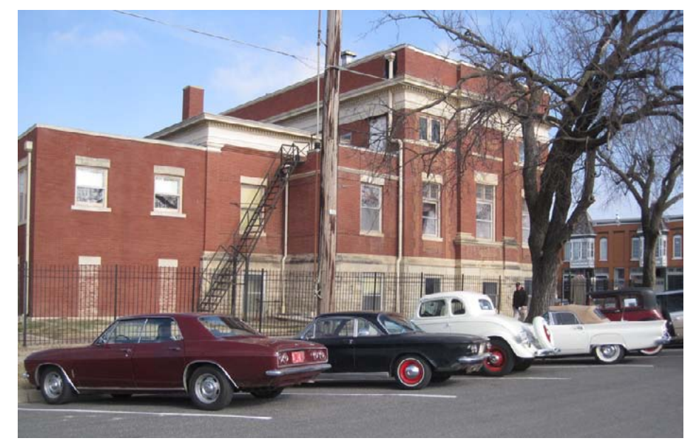
Terry and Greg's Corvairs are parked beside the old Carnegie Library in Newton during January of 2011. They were on a tour of Newton with the Wichita Vintage Chevrolet Club. They at at the Bread Basket