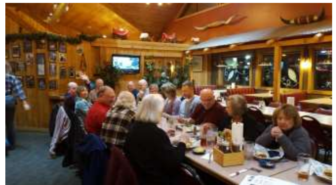
December 2019, and we got together at Longhorn BBQ in Spokane Valley.