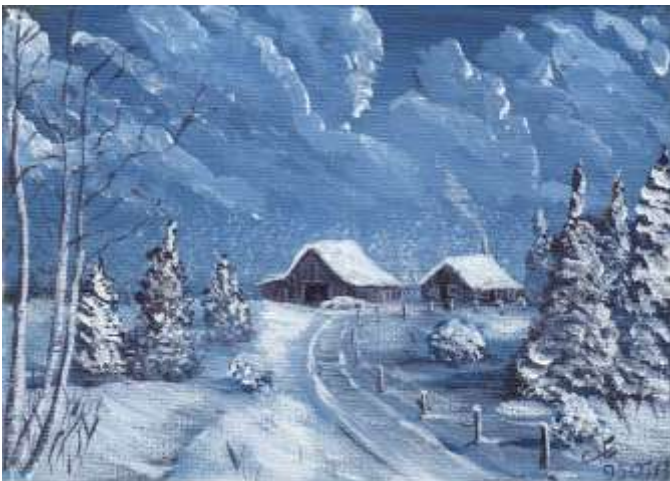
If you look closely, there is a snow-covered Corvair in front of the barn.

Inland Northwest Corvair Club P. O. Box 9689 Spokane, WA 99209-9689