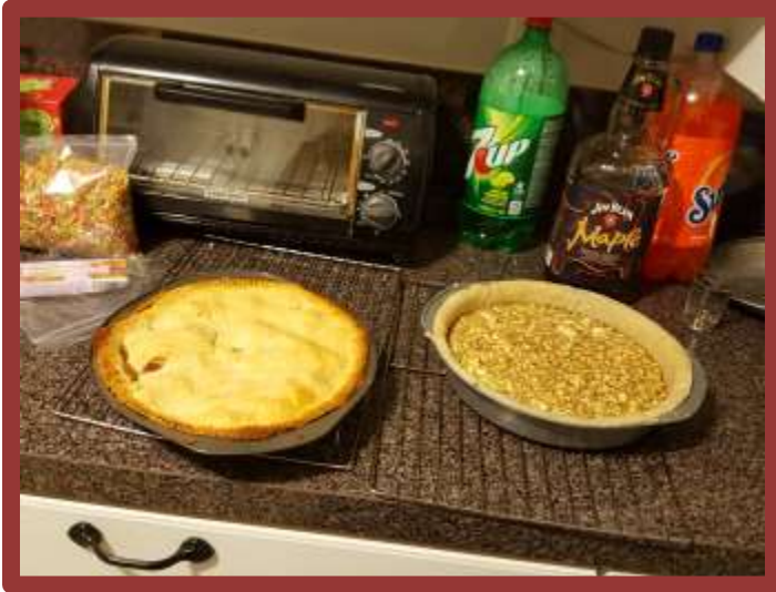
From our kitchen a few years ago. The apple pie on the left has just come out of the oven. The oatmeal pie to the right is ready to go in.

until blended. Stir in rolled oats. Pour into pie shell and bake at 350° for about an hour, or until knife (or toothpick) inserted into the center of the pie comes out clean. While baking, the oatmeal forms a chewy “nutty” crust on top.