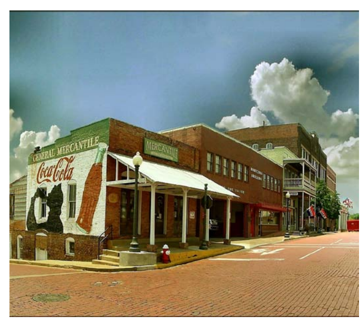
Downtown Nacogdoches reflects the heritage of being the oldest town in Texas and host of 2021 HOT.