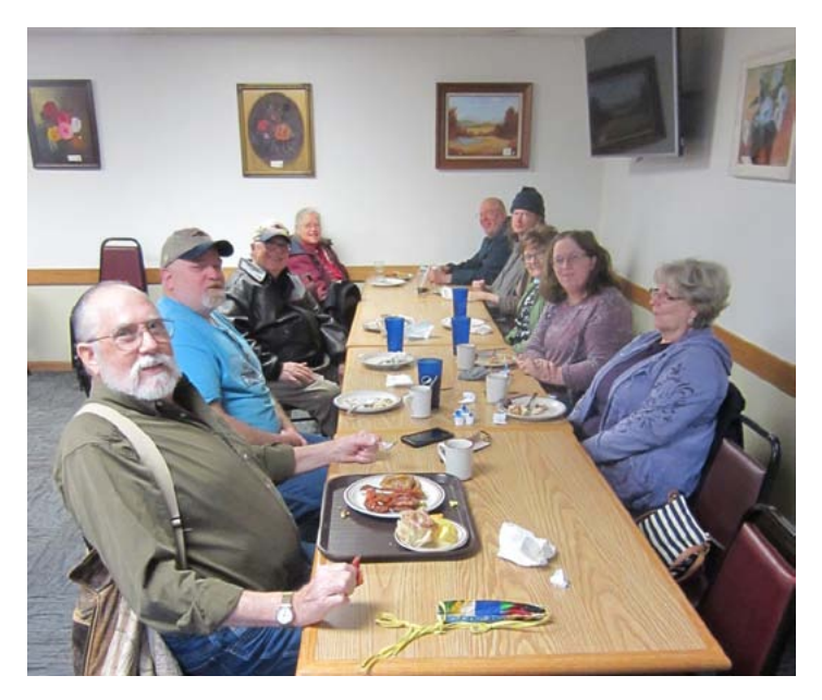
MCCA members had the back room of the Bread Basket in Newton pretty much to themselves for the January club breakfast.