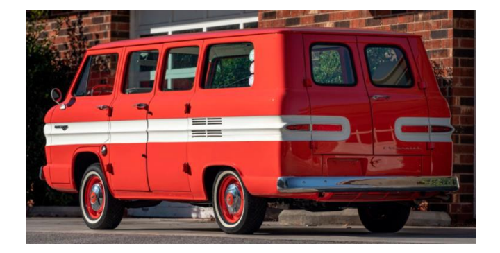
SOLD! 1965 8-door Greenbrier at Kissimmee, FL in January for $103,400 !