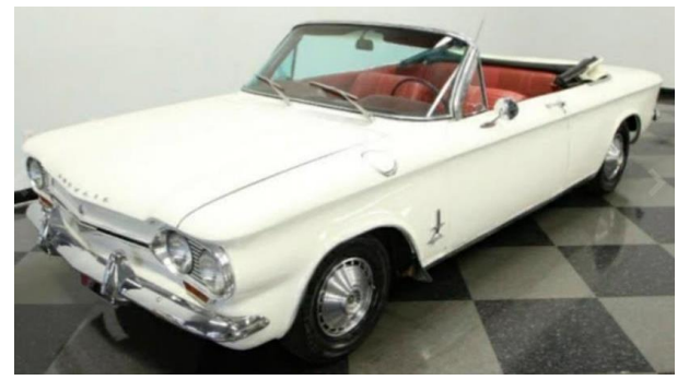
1964 CHEVROLET CORVAIR MONZA SPYDER Sold; $11,000