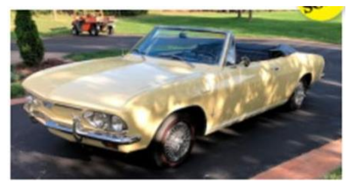
1966 Corvair Convertible $27,500