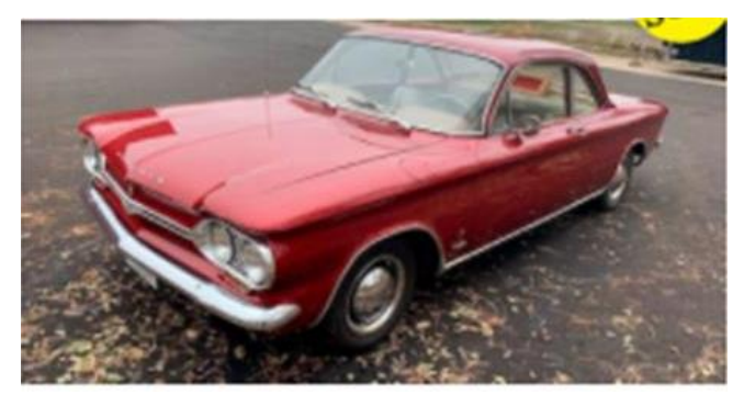
1964 Corvair Monza $11,500