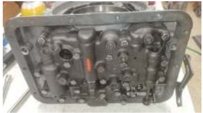
Transmission, rebuilt all new seals, gaskets, rebuilt valve body etc. Also, did the oil cooler mod so I can make sure it keeps cool on long uphill trips.