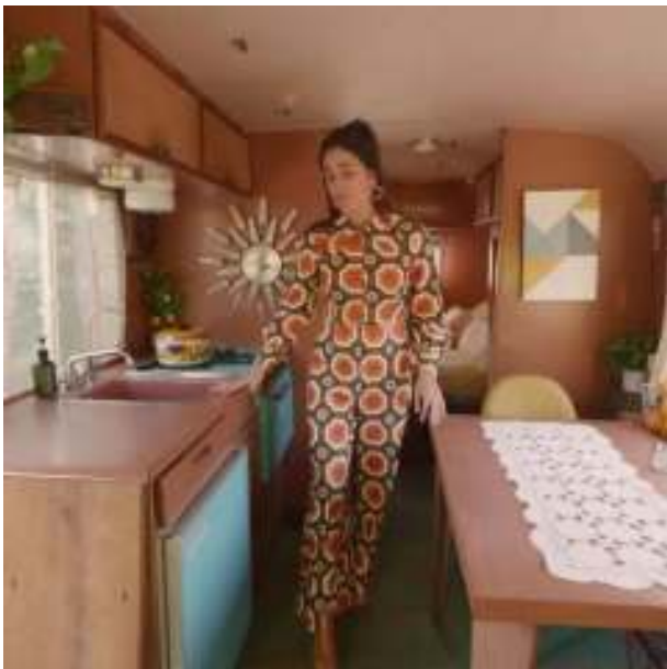
Interior of this Ultra is totally retro. Worth a watch just to see the furnishings.