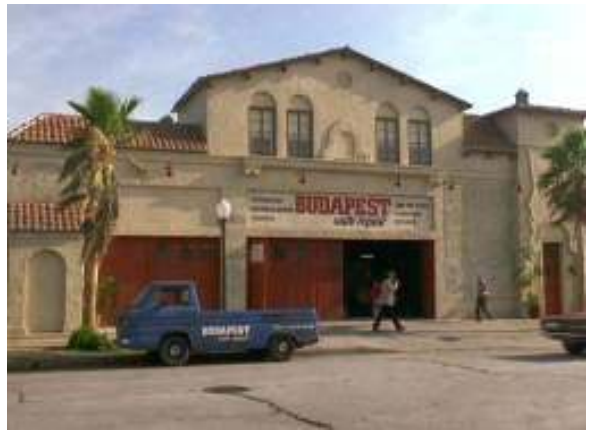
Some screen shot pictures from the 1994 Movie My Girl 2 borrowed from the IMDB