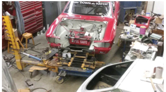
4. At Dave Edsinger's shop. Check out all those big hydraulic tools!