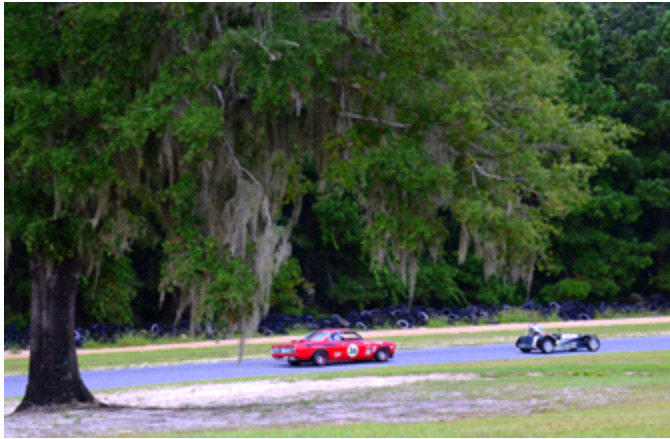
1. Norris chasing the Lotus, right before the Lotus spun in the middle of the track.