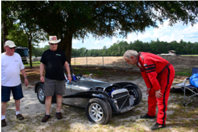
3. The Lotus didn't get off easy either.