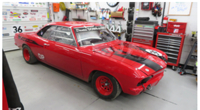
6. Now ready for reassembly in time for the 2021 season.