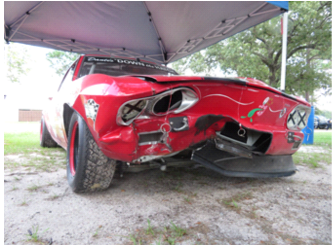
2. Ragged Red Racer's nose after Lotus contact.