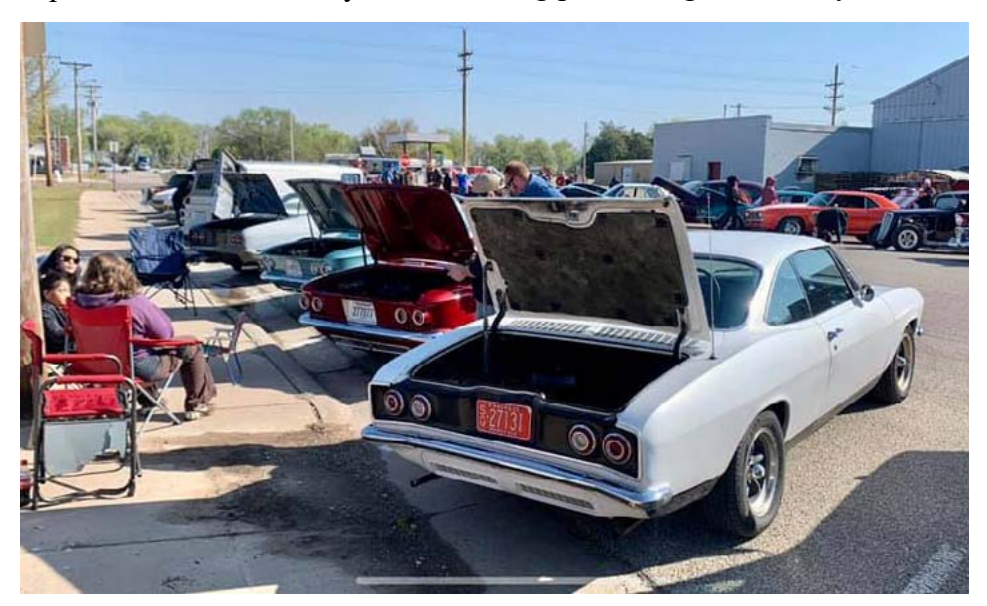
Upon arrival, the Corvairs were backed in next to the sidewalk downtown, engine lids hoisted and lawn chairs unpacked.

With much planning, including purchasing a car of my own