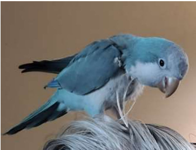
Stormie, Editorial Assistant

Great that we've have club activities the past two months and have one coming up again this month. (See information in this edition of the REAR ENGINE REVIEW.) It's a sign things are getting back to normal.