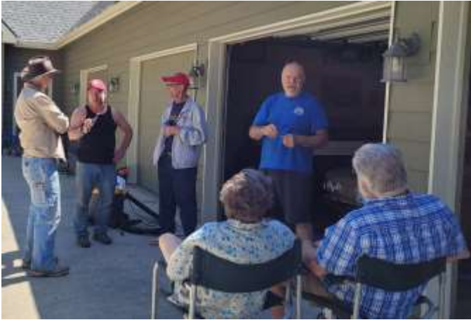
Shootin' the breeze!

Turnout for the event seemed to be less than expected, but a handful of core members put in an appearance. Your reporter doesn't recall seeing any cars, Corvairs or otherwise being washed, but at least one individual was working on cleaning interior windows. The glass was clouding up from the interior vinyl outgassing after prolonged exposure to the sun.