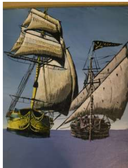
In progress/tentative cover art for Darnahsian Pirates: The Third Stone Island Sea Story