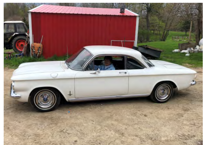
Read Linda Tennant's article on page 2. Picture #1, Mother's Day 2019

This is due to the 300 Bowl being closed for the July 4 th holiday. The August meeting will be at its normal first Monday.