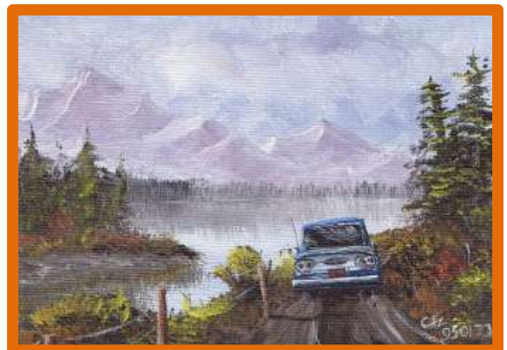
My painting, titled, "Rampside at the Lake," painted several years ago.

I usually have copies on hand, so contact me if you are interested. daveeva@comcast.net Visit: www.stoneislandseastories.com