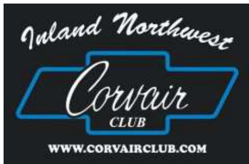
The front of the card looks like this.