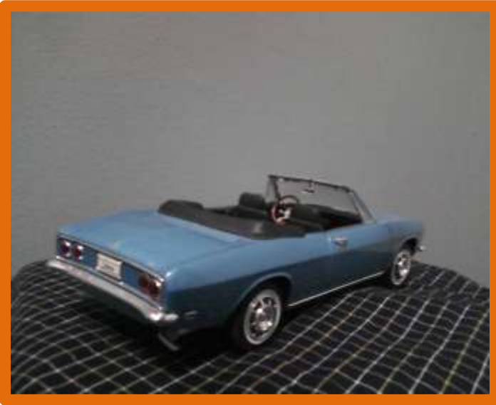
My 1969 Corvair convertible, a 1/12 scale, die-cast model

It's been great that we've been able to get together a few times lately for some club activities. I think we are all hoping that this recent uptick in Covid cases is temporary and only a minor setback on the road to full recovery and a return to normal. That being said, if anyone has an idea for a club event or activity, why not contact our vice-president and let him know? He also holds the position of activities chairman. You are also welcome to pass it along to me so I can list it as a tentative activity on our event calendar.