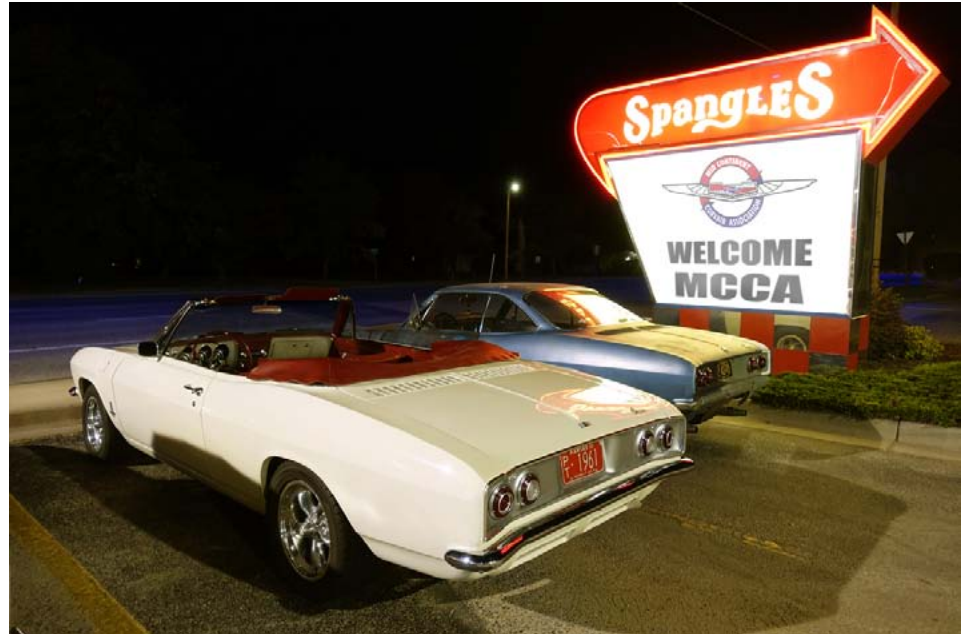
It was a perfect evening for ice cream after the August 14 MCCA meeting. Nine Corvairs took the short trip from the Kalp shop to the Spangles in Park City. The welcome part of the sign was PhotoShopped.

After the August miles were tallied, MCCA members had racked up 10,637 reported miles in their Corvairs since January 1, 2021. One member surpassed the 2k miles mark in that time period, while four others logged more than 1k miles. Another showed 900+.