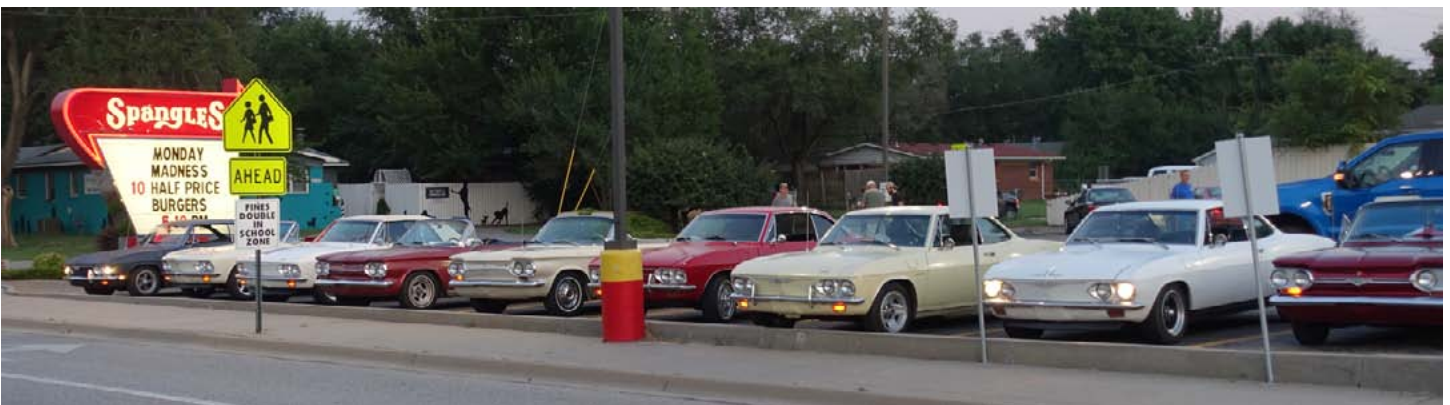
After the meal and meeting, nine Corvairs caravanned to the Spangles in Park City for ice cream.

With the business and the burgers settled, the final event of the evening was a short road trip to Spangles in Park City for ice cream.