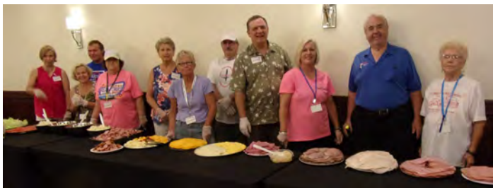
Your Hospitality Room Crew for Homecoming 2021