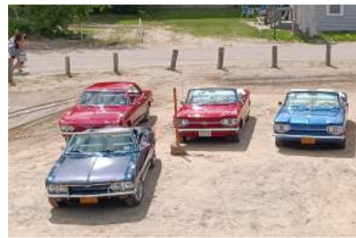
Nice picture from Jane C