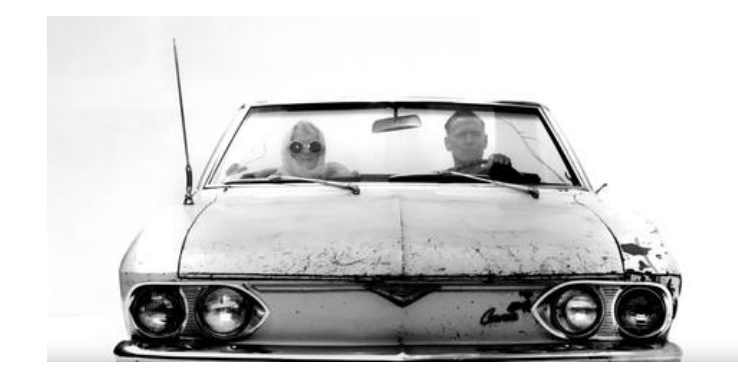
Bryan Adams - So Happy It Hurts - music video

See Show and Cruise news for updated shows! <a href="https://www.showandcruisenews.com/">https://www.showandcruisenews.com/</a>