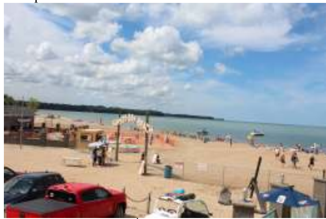
Great view from the 2<sup>nd</sup> floor during lunch.