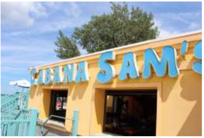
On to Cabana Sam's for lunch.