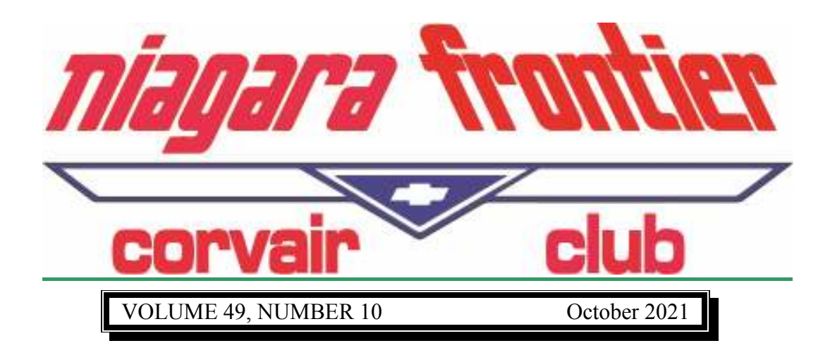
Formed By And For Those Who Still Appreciate The CORVAIR Automobile