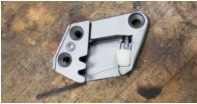
Tom restored the door latch strikers.