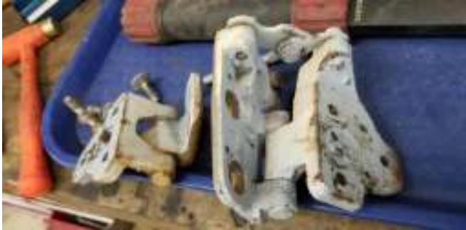
Rebuilt and powder coated door hinges including new brass bushings.