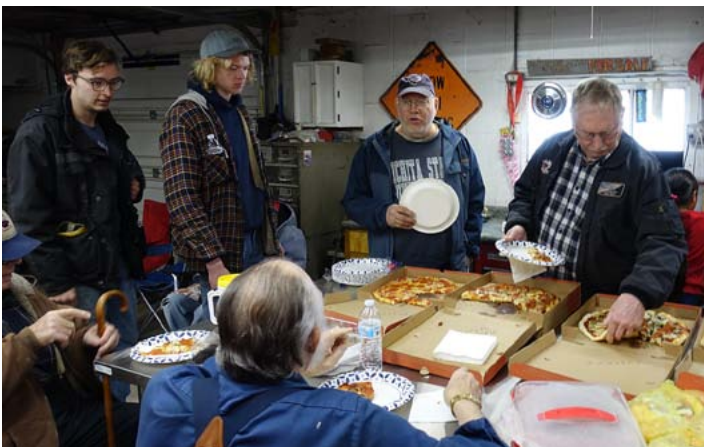
Plenty of pizza pies in the lunch line for Cold Tuna.

· Hey all, I'm new and I just bought my Corvair and road tripped it home about 250 miles I live in Newton, KS but am in college at Leavenworth. I joined so I could get the help I need on making just little fixes and she's a ready to go reliable vehicle! I just need to correct the timing and carburetor adjustment. It's a Powerglide 140hp Monza convertible. That is all it really needs at the moment! It's mostly original with 89k miles. Thank you all! Hopefully this summer I can be out and about and join you guys.