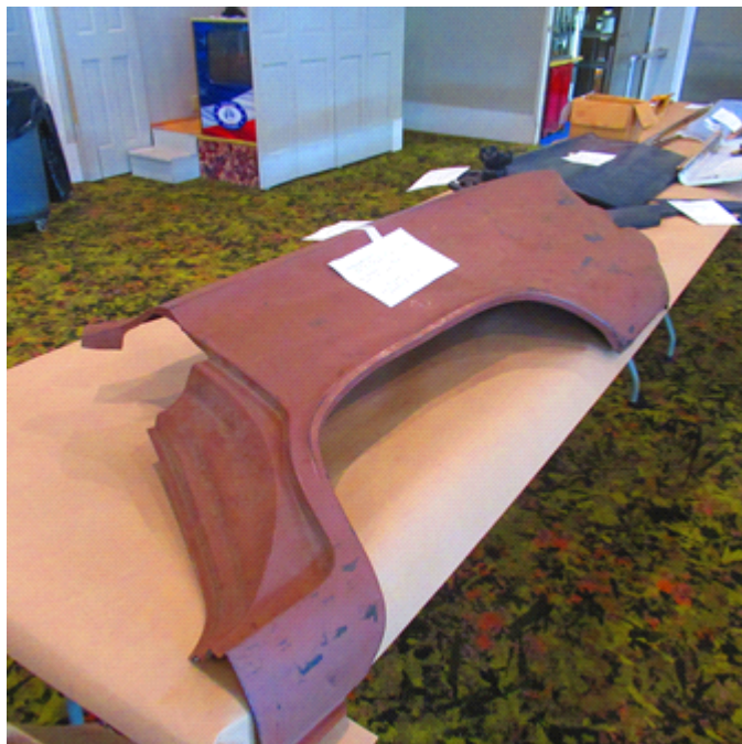
This rear fender was just one of the several NOS parts.