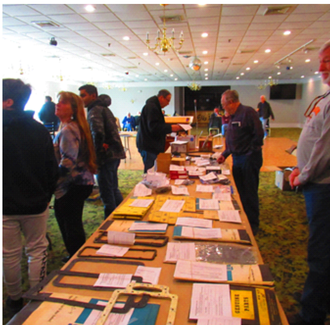
This is just one of several table-fuls of parts auctioned this day.