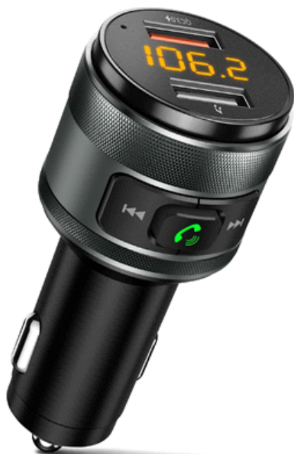
Above: IMDEN Bluetooth 5.0 FM Transmitter for Car, 3.0 Wireless Bluetooth FM Radio Adapter Music Player FM Transmitter/Car Kit with Hands-Free Calling and 2 USB Ports Charger Support USB Drive

Both my Corsa and Chevelle have modern digital FM radios. I have not tried this on an older FM radio. I also purchased a cup holder / mobile phone mount for the Corsa so I could have my phone at arm's reach to answer a call. Both items were purchased at Automania.