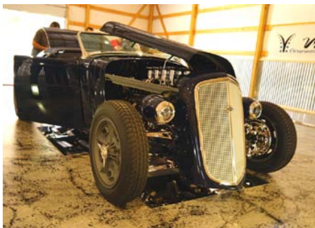
ABOVE: The 2022 America's Most Beautiful Roadster was on display in a building near the show area. Bernie Strecker had a hand in perfecting the wheels for the Chevy. RIGHT: Bernie shows off the engine compartment of his Corsa convertible to a spectator.