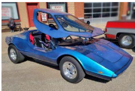
A Sterling kit car. Most of these kits used air cooled VW power.