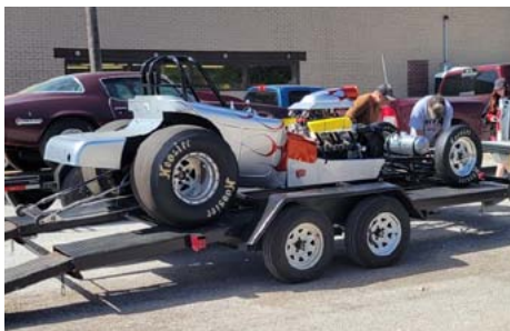
A T Altered there for the drags.