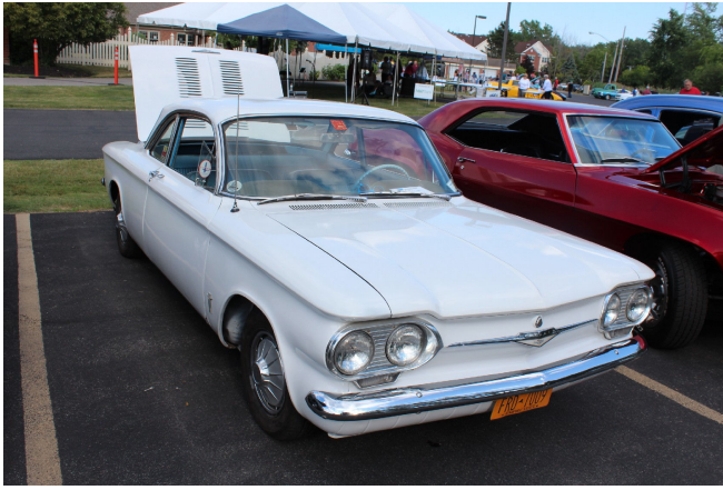
Ben Wild was also at Beechwood.